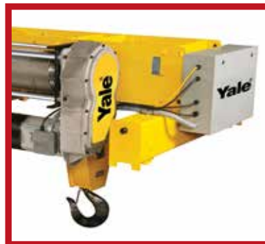
Hoists & Winches, Spare Parts