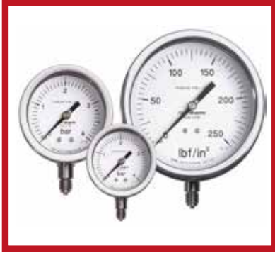
Pressure Gauges (brands: Wika, Nuova Fima etc..)