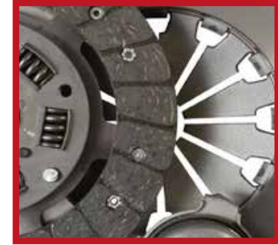
Spare parts for Clutches