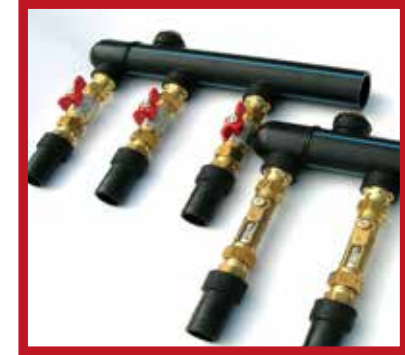
Fitting, Valves & Flanges for pipeline and Manifolds (BW and SW fittings for mud pipes AISI 4130 or API5L)