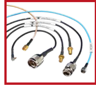
Electric & Electronic Cables