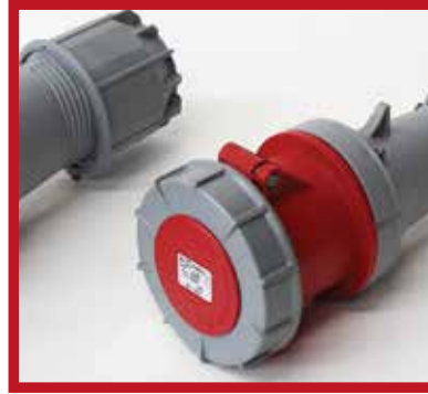
Electric Plugs & Connectors (Amphenol plugs or equivalent)