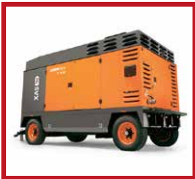
Electric & Diesel Air Compressor