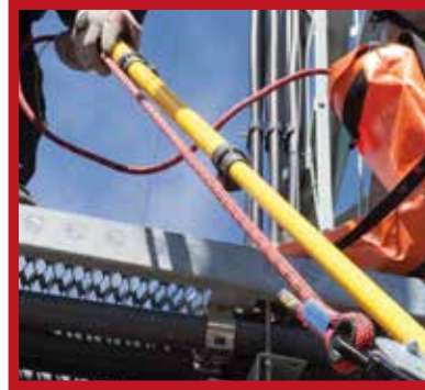
Climb Assist, Fall Arrest, Safe Anchorage Devices, Work Suspension System