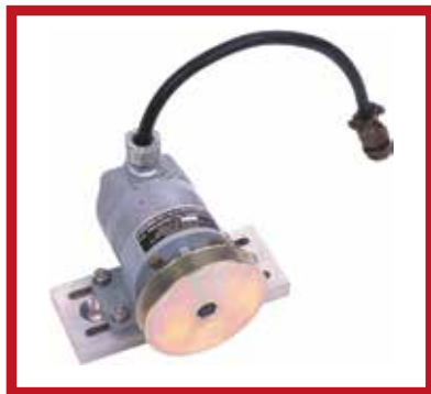
Spare and Expendable parts for centrifugal Pumps (original spares Forum SPD and Mission)