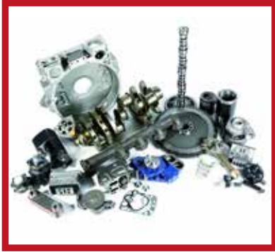
Engine's Spare Parts