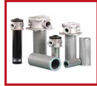
Hydraulic & Pneumatic Filters