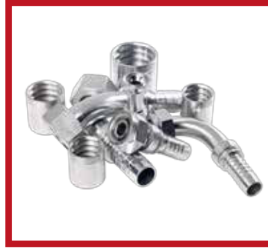
Hydraulic & Pneumatic Hoses & Fittings (Parker brand or equivalent)