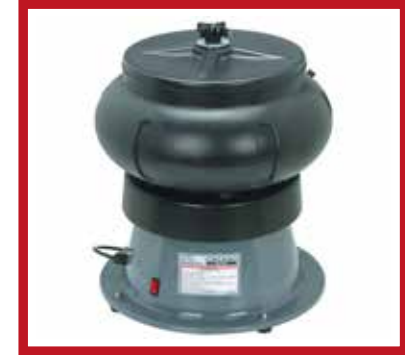
Rotary Vibratory Hoses