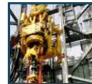
Air & Hydraulic Circuits