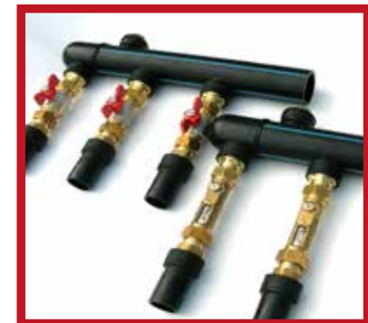
Manifolds, Pipe & Fittings